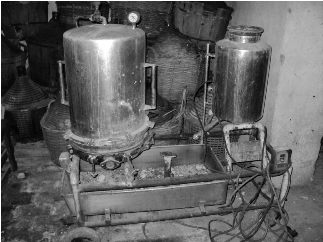
1 Filtering machine.

The wine filtration included several work steps. Initially, about 50L of wine were poured into a